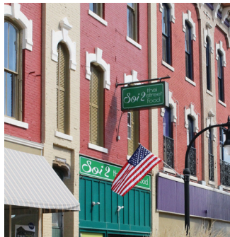
1825 2nd Ave.